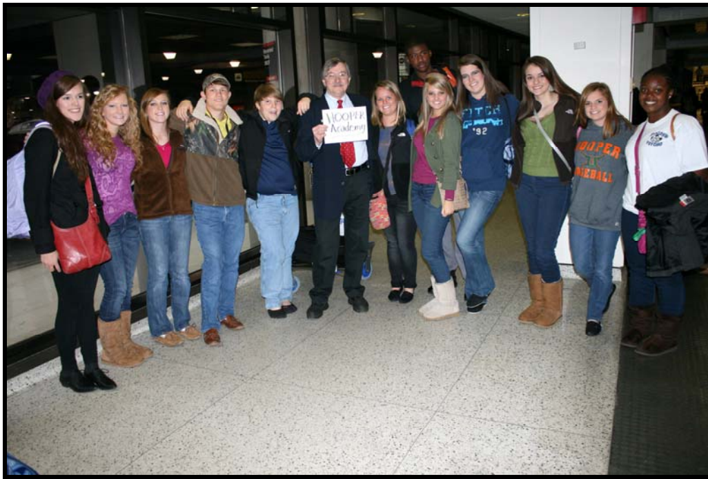
Arriving in Boston