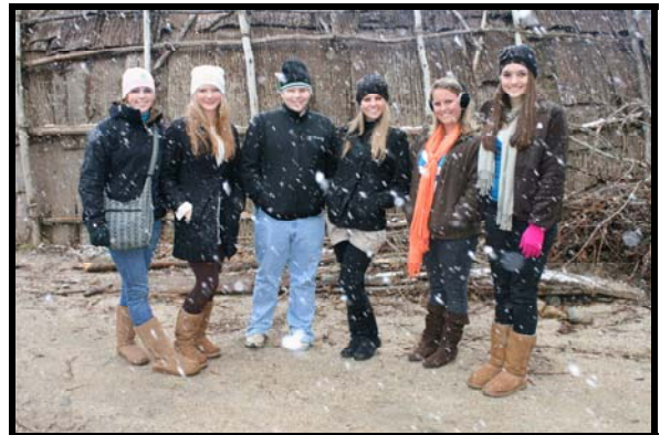
Enjoying some SNOW at Plymouth Plantation