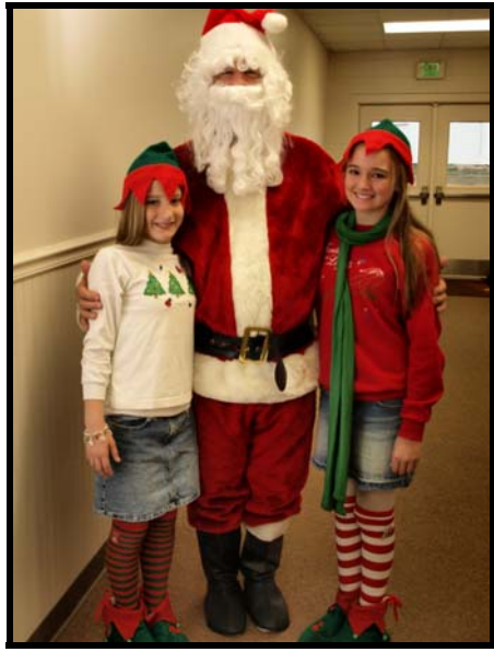
Santa and his Elves

During the week of December 1 st the 6 th grade class sold candy cane grams before school to raise money to attend Space Camp. On December 10 th , the candy cane grams were delivered to the K-5 to 5 th grade classes by Santa and his elves. The other sixth grade students paired up and delivered to the 6 th to 12 th grade class homerooms.