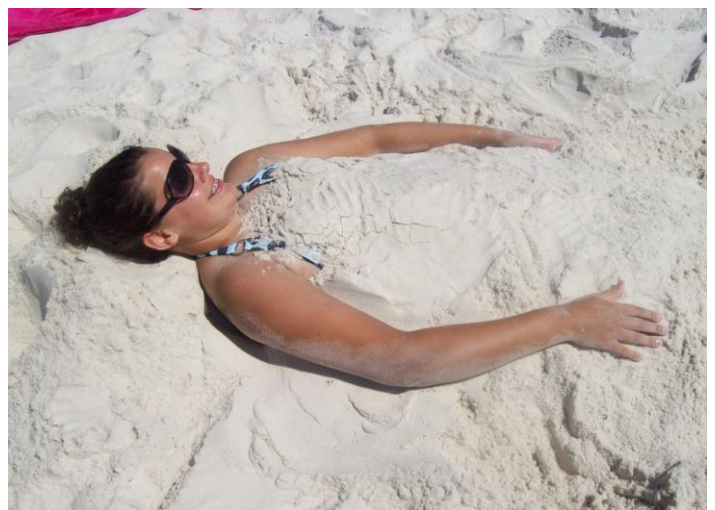
WHITNEY GETS BURIED